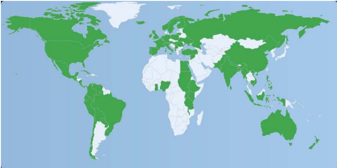
Europubhealth graduates' countries of origin since 2006

“Europubhealth brought me tremendous benefits and a pathway to a PhD program” Phong - Vietnam